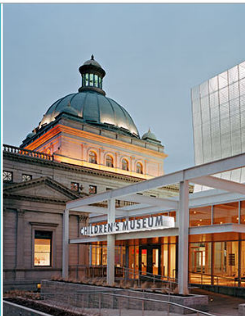
Koning Eizenberg Architecture; Perkins Eastman Architects