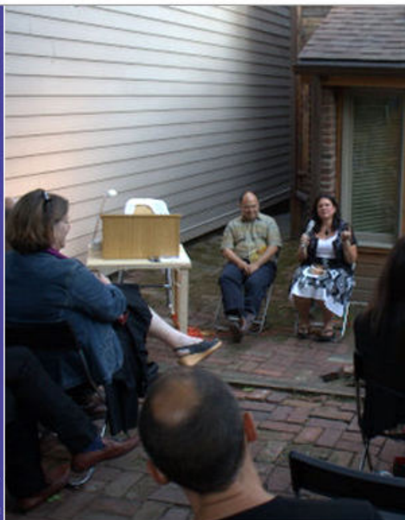
North Side poetry reading (Charm Bracelet Project)