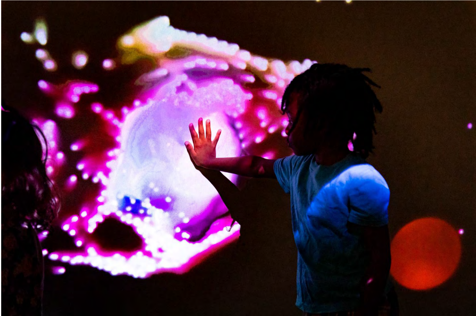
Buhl Hallway Photo