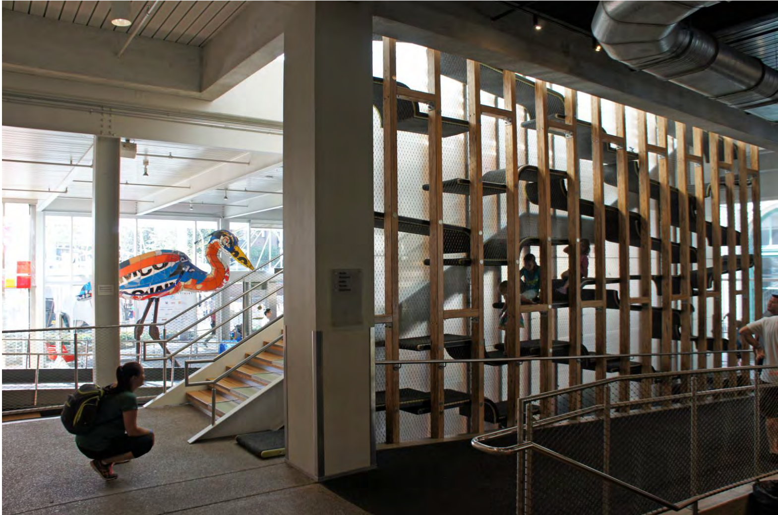
Limb Bender Photo