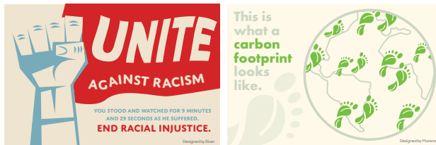
One of the postcards created by after school youth

For many years, the Children's Museum's has offered Sensory Friendly Days and a sensory friendly Halloween event where sound, lights and other stimuli in the exhibits and spaces are reduced to accommodate families with neuro-diverse members. We have noise-cancelling headphones, weighted blankets and fidgets available should visitors need additional tools.