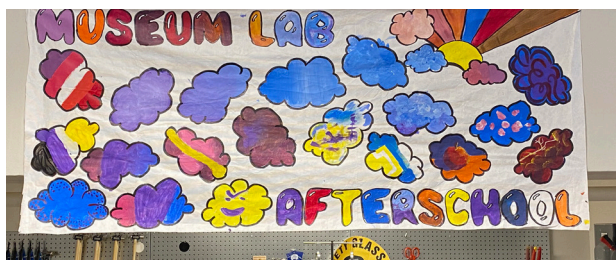
Banner created by after school youth

We provide ASL and Spanish-speaking interpretation for programs when needed, so that neither linguistic diversity nor disabilities are barriers to joining them.