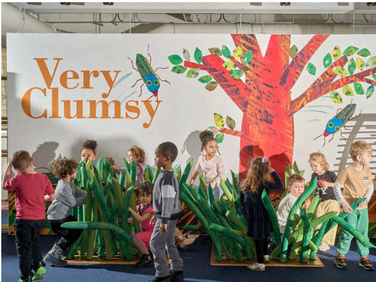
Preschoolers from Pittsburgh Public Schools hiding in and weaving through a field of four-foot-tall blades of grass in “The Very Clumsy Click Beetle” section of “Very Eric Carle.”

Eric Carle’s quintet of “Very” books — “The Very Hungry Caterpillar,” “The Very Quiet Cricket,” “The Very Lonely Firefly,” “The Very Clumsy Click Beetle” and “The Very Busy Spider” — teach children not only early learning concepts like counting and sizes, but also moral principles like patience and empathy. Drawing from the books, the exhibition invites museumgoers to step inside the author and illustrator’s nature-filled worlds through hands-on environments and art-making inspired by his distinctive collage techniques.